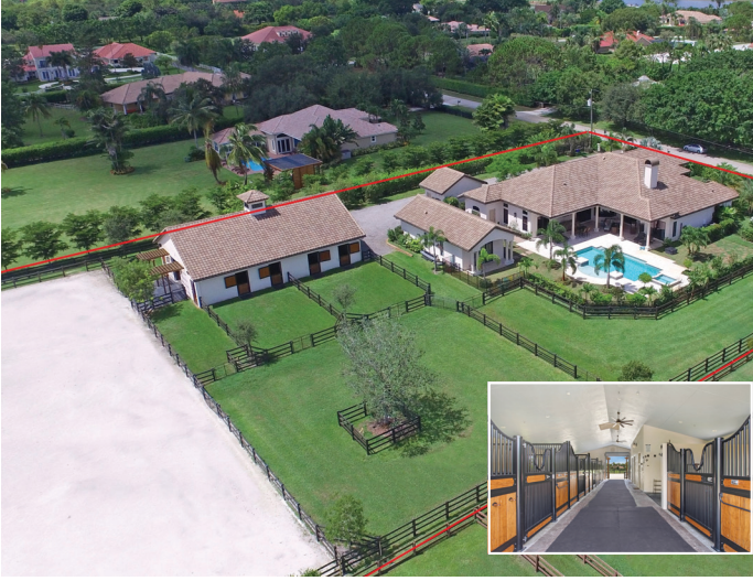
away from Palm Beach International Equestrian Center, this incredible 10-acre SEASON | RX10258094 | This lavish 4 bedroom, 4.5 bath estate features impact farm is fit for any professional rider. The 12-stall center-aisle stable, complete glass, fireplaces throughout, a gourmet kitchen, and a detached 1 bedroom, with the finest amenities, recently underwent a full renovation, leaving it totally 1 bath guest cottage. A full summer kitchen and heated pool and spa can be updated and ready for the new season. The property features a spacious owner's found in the expansive backyard. The 7-stall center-aisle barn is furnished with