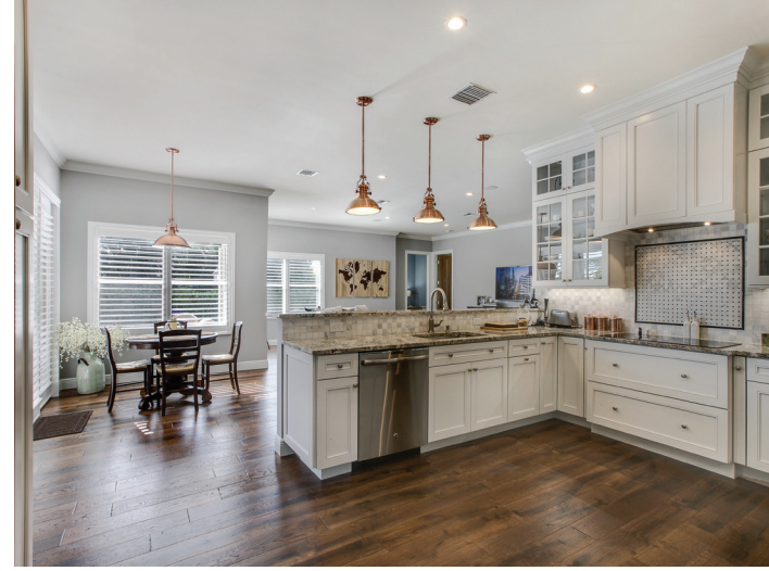
MIZNER ESTATES | $2,200,000 | RENT AT $25,000/MONTH FOR SEASON LAKEFIELD WEST HOME | $799,000 | RX10386309 | Within the private gated | RX10379788 | A rare find in the Palm Beach Polo & Country Club, this 4 community, this 4 bedroom, 4 bath home boasts modern finishes with a stylistic bedroom, 6 bath courtyard home includes a guest cottage. A perfectly manicured nod to rustic charm. Meticulous renovations have yielded a 2-car garage, courtyard with lush landscaping, comfortable lounge areas by a private pool, hardwood floors throughout the home, a striking gourmet kitchen, and walk-in closets. Custom stone detailing flows from inside the residence through to the an immaculate kitchen, breakfast nook, high ceilings, and detailed design make outdoor patio, centered around a pristine pool. With views overlooking the 18th fairway of The Wanderers Club Golf Course, this spacious lot is the ideal place