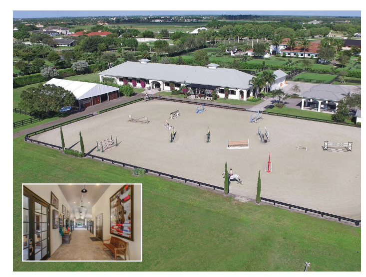
lounge with full kitchen and 2.5 bathrooms, a large grand prix field, and a new a tack room, wash stall, feed/laundry room, sand ring, and plenty of paddocks. ring with top-grade fiber footing.