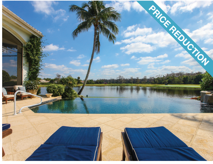
outstanding indoor/outdoor living experience. The full-length frameless windows bring light, openness and sophistication to this opulent residence.