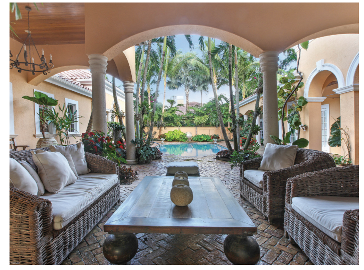
and a lakefront view highlight the outdoor living space. Inside the main house, this home a truly special find. This property offers secluded luxury at its best!