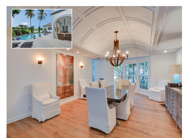
BROOKSIDE II | $2,450,000 | RX10352694 | Located in the Golf Brook LUXURY HOME IN MIZNER ESTATES | $2,895,000 | RX10316148 | This neighborhood of Palm Beach Polo & Country Club, this 5 bedroom, 6 full and secluded estate home features the best view in Palm Beach Polo & Country 2 half bath home has been masterfully redone. Additions include a new roof, Club. With an infinity edge pool that seamlessly blends with views of the lake, upgraded kitchen and baths, and brand new wood flooring. There are hurricane golf course, and the 92-acre wildlife preserve, the 4 bedroom, 5.5 bath home impact glass windows and French doors throughout, many of which include features pocket glass sliders in the kitchen and family room that allow for an Phantom Screens.